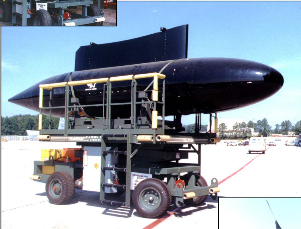
MWS16 C130 Turbine Removal/Replacement Maintenance & Fuel Pod Installation Tool