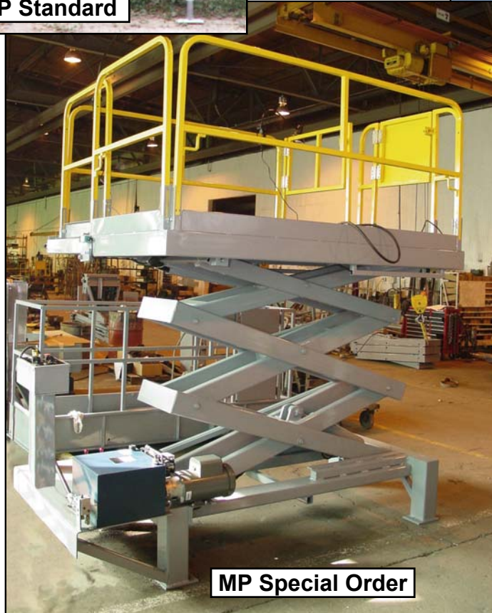
MP Special Order