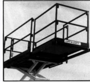
Extenda-Deck™ 4' Rollout Platform Extension