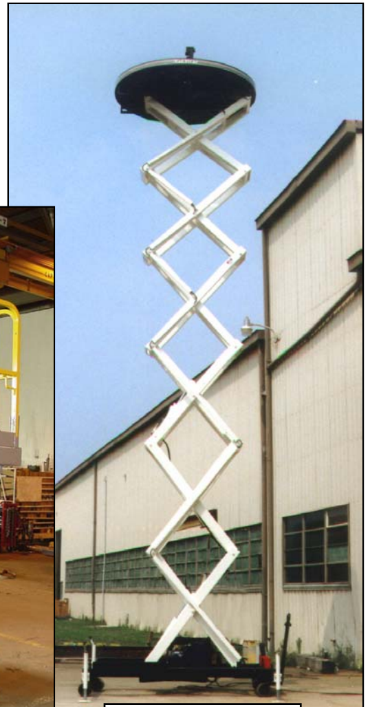
MP Special Order

LIFT-A-LOFT has 5 standard models of the M anually P ositioned lifting platforms. The MP lends itself to various engineered special order items that have been produced over the years. These units could either be stationary or mobile, according to the needs of the final consumer.